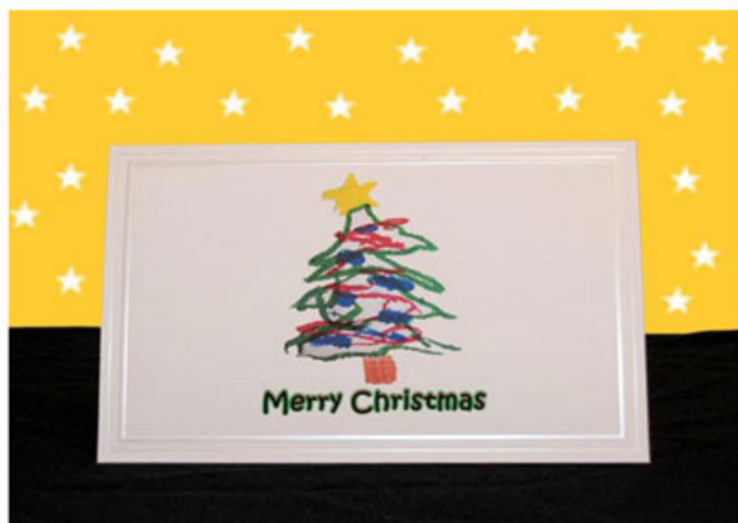
CHRISTMAS TREE - CT PACK OF 10 GREETING CARDS