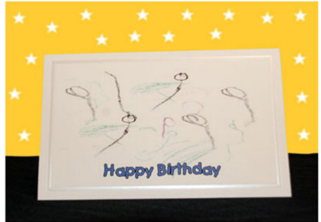
BIRTHDAY BALLOONS (BLUE) - BL PACK OF 10 GREETING CARDS