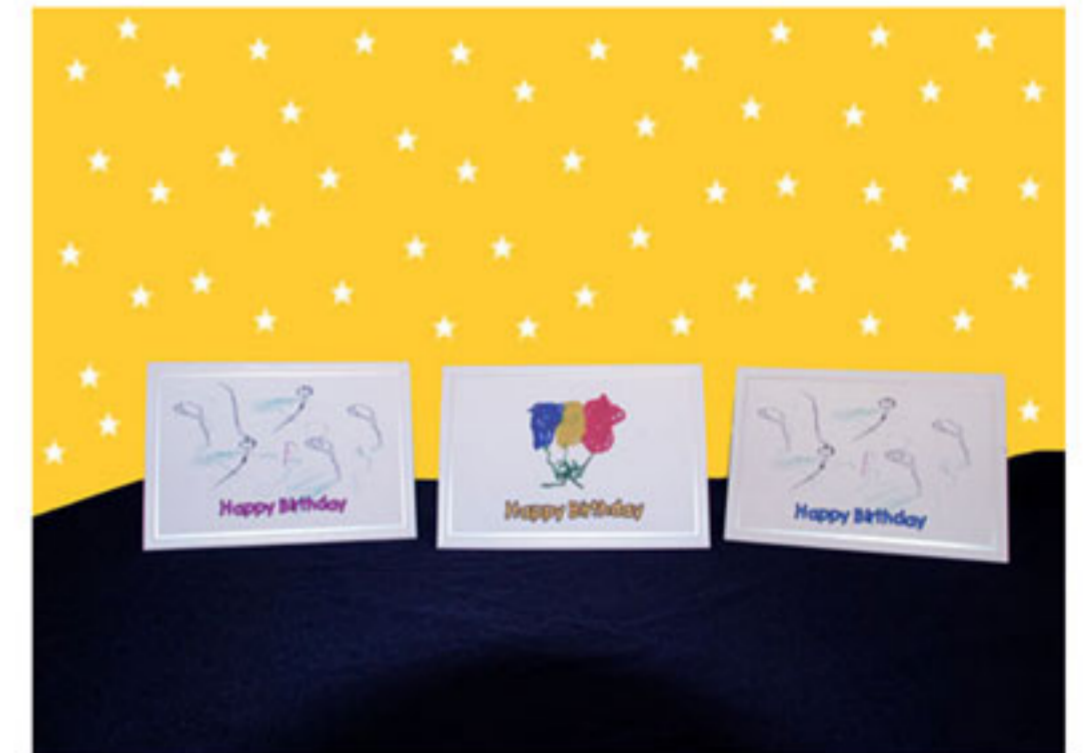
BIRTHDAY BALLOONS ASSORTMENT - AB ASSORTMENT OF 10 GREETING CARDS