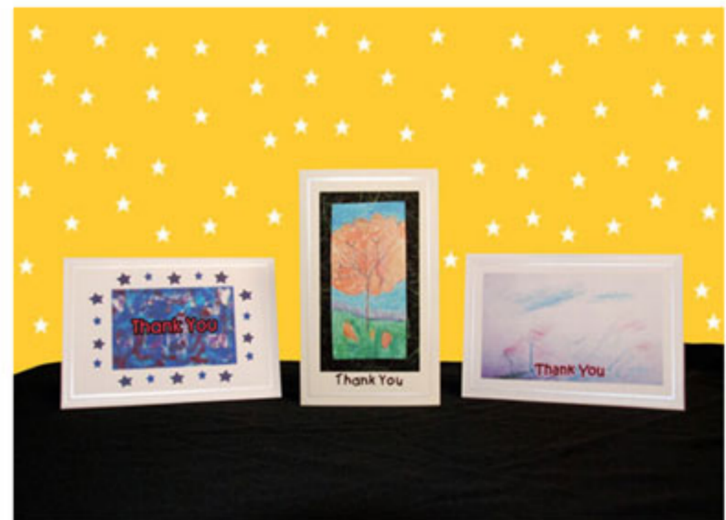
THANK YOU ASSORTMENT - AT ASSORTMENT OF 10 GREETING CARDS