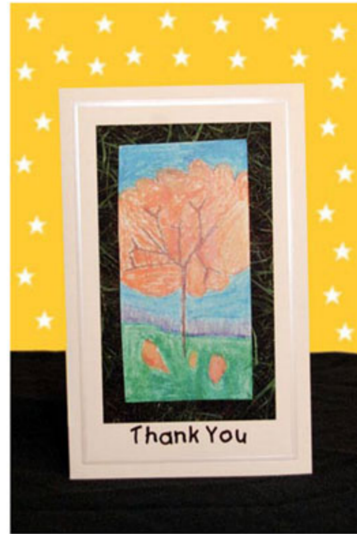
AUTUMN TREE - TA PACK OF 10 GREETING CARDS