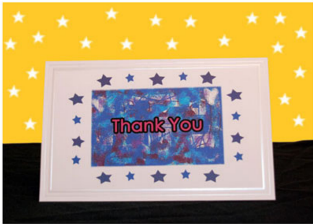
ABSTRACT STAR - TS PACK OF 10 GREETING CARDS