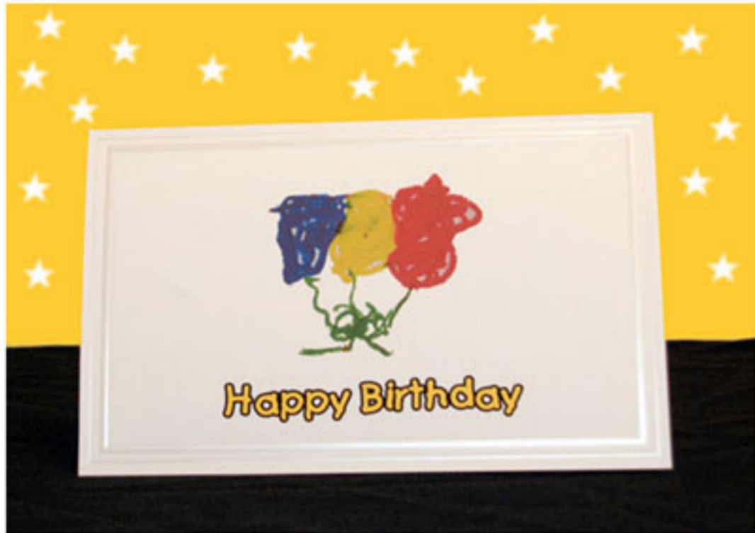
BIRTHDAY BALLOONS - BB PACK OF 10 GREETING CARDS