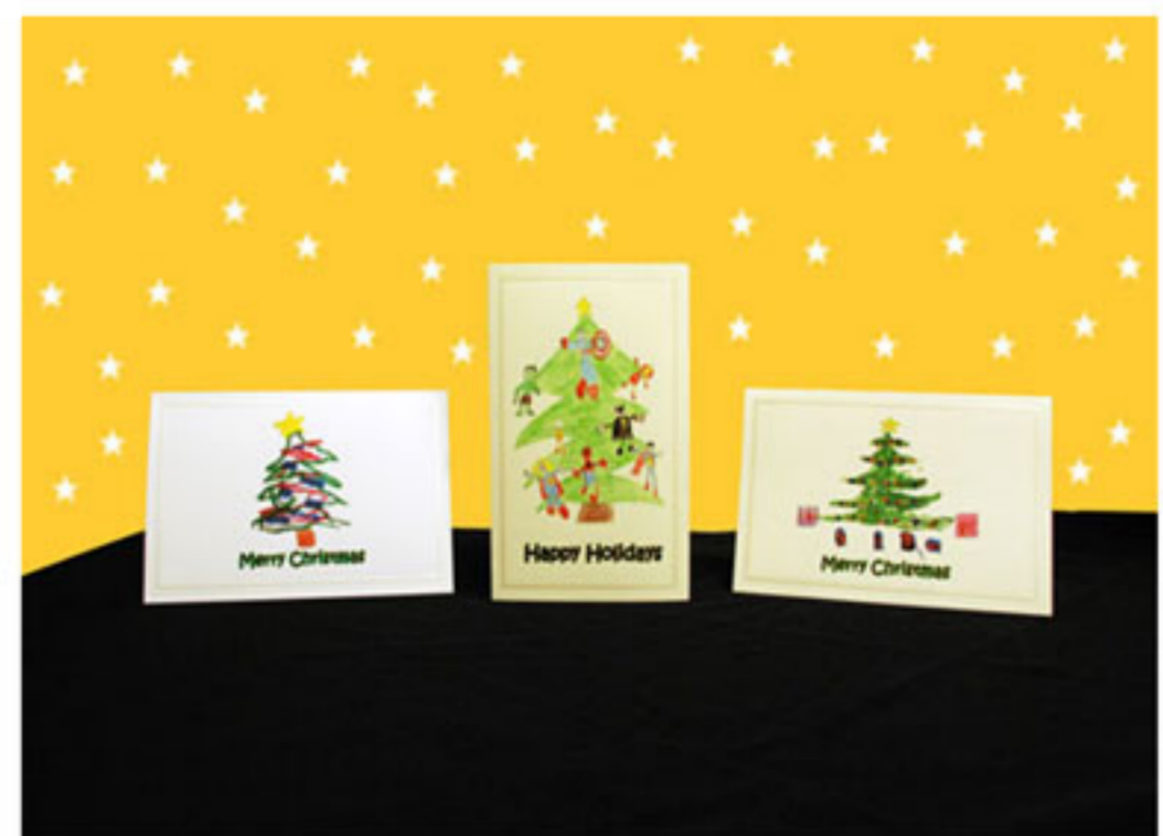
HOLIDAY ASSORTMENT - AH ASSORTMENT OF 10 GREETING CARDS