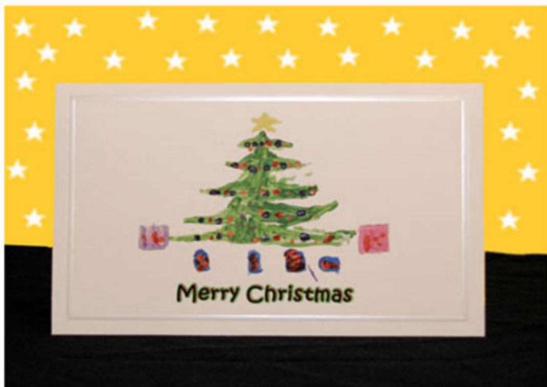
CHRISTMAS TREE W/ PRESENTS - CTP PACK OF 10 GREETING CARDS