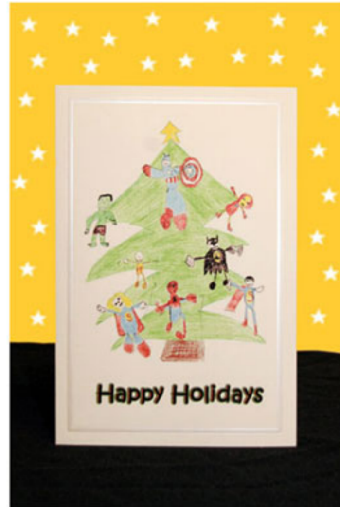
HAPPY HOLIDAYS - CH PACK OF 10 GREETING CARDS