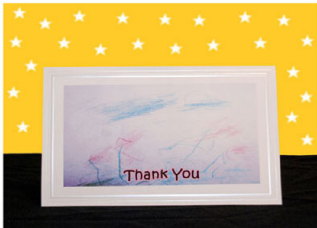
GARDEN SCENE - TG PACK OF 10 GREETING CARDS